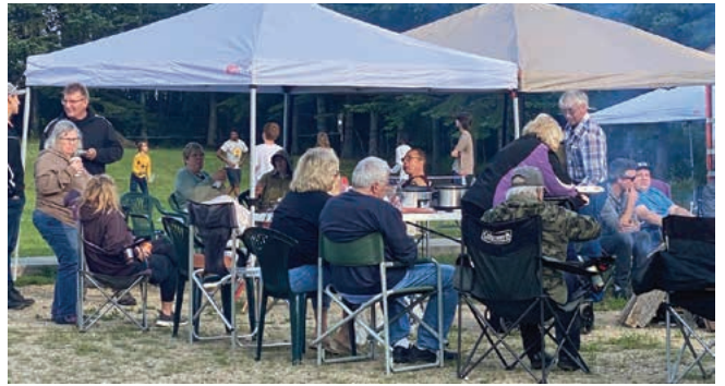
Campout. The annual campout, hosted by the Parkland congregation, took place July 28-30. Despite the lower-than-expected turnout, the district members enjoyed a Spirit-filled family time on the vast, lush Parkland church grounds. The celebratory and worshipful atmosphere could not be contained.