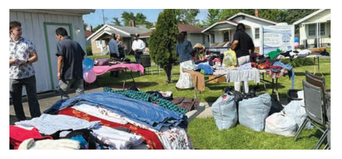
Community outreach. On May 25, the Lafayette Street church in Fort Wayne, IN, reached out to its community with the message "Introducing Jesus Christ and His