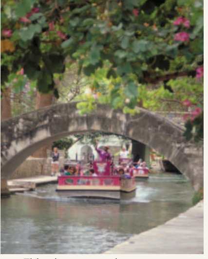
This photo was taken at a past G. C. Convention. Can you name the location?

What do you remember about past conventions? Go to convention.cog7.org and click on Convention Memories. Also read the full text of these memories and others.