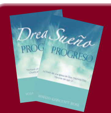
Sueno Progreso Now Available in Spanish! Dream in Progress: The Vision of a Vibrant Church of God (Seventh Day) by Whaid Rose

An online bookstore is available on the General Conference website. The number of books available will gradually increase until we have a selection of several dozen on various topics. You can make your selection and pay with credit card. Visit coq7.org/ store.