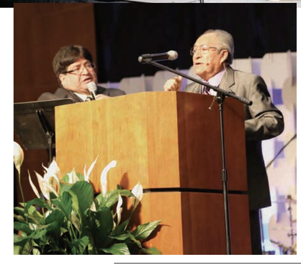
August - September 2013 • 3