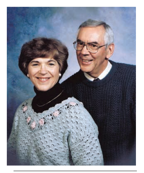
February - March 2015 • 5